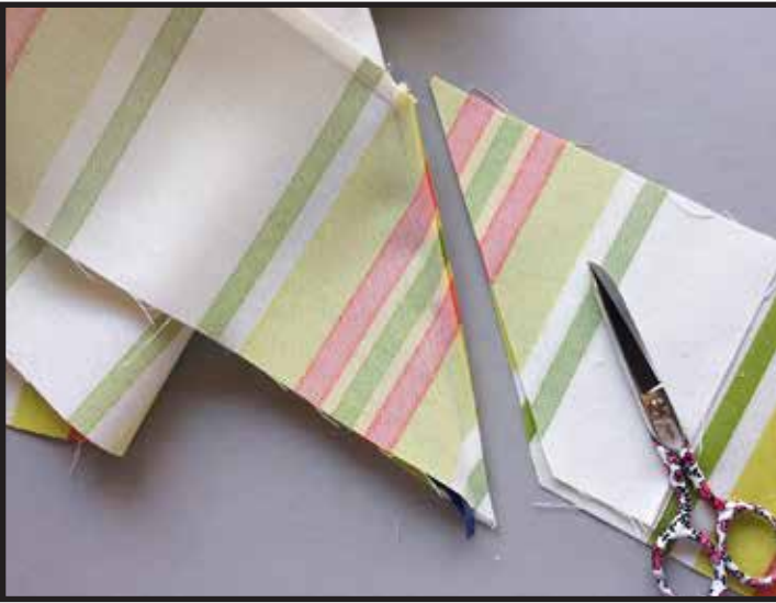
12. Cut the seam down to ¼". Press open.