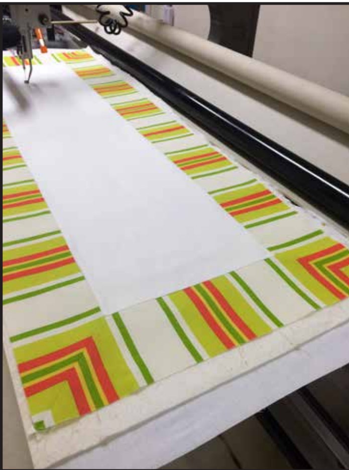
13. Repeat this process with all four corners. Don't be discouraged if the first three corners don't turn out ;) this takes a little finesse sometimes. You'll get it, I promise!